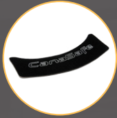
Replaceable CanaSafe sweatband