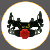
Replaceable CanaSafe helmet suspension (Twizloc)