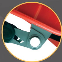
SWivEL feature for Twizloc harness ONLY