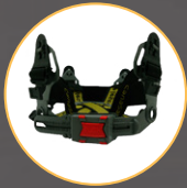
Replaceable CanaSafe helmet suspension (Pushloc)