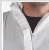
Single zip with resealable flap