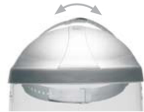
Easy change™ replacement system