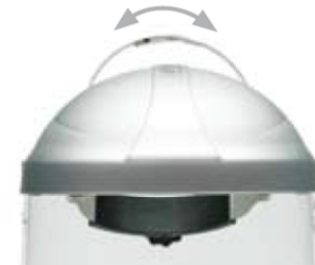
Easy change™ replacement system